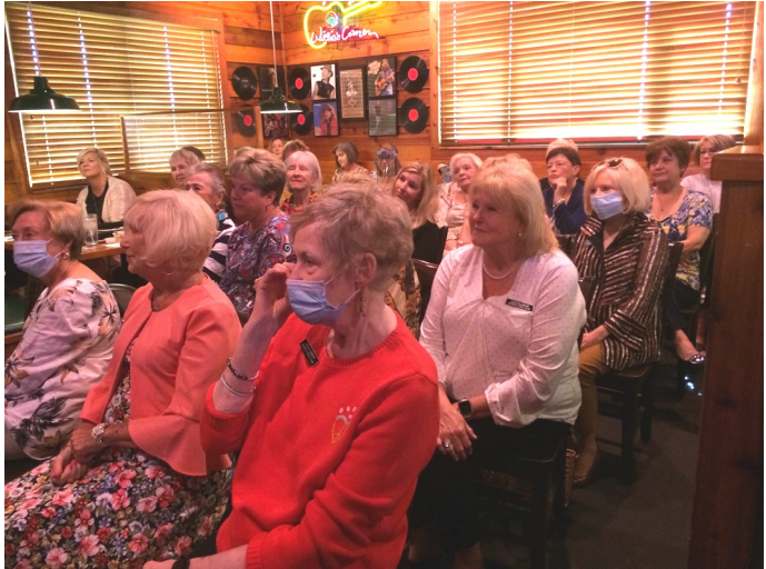
Seating was arranged so everyone could see and hear the speaker and business meeting better. Then they returned to their seats where Texas Roadhouse served their delicious meals.